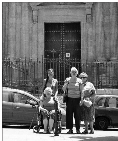
Friends outside the cathedral

Lux Mundi Ecumenical Centre, Torre del Mar. Avda. Moscatel 1ª, (Jardines Viña Málaga/Antigua Casa de la Viña), Torre del Mar, 29740. Opening hours Monday through Friday 10.00 to 13.00 and 15.00 to 18.00. Tel.952 543 334 E-mail: luxmundi@lux-mundi.org Web: www.lux-mundi.org