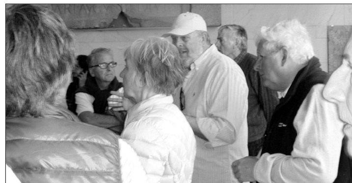
Listening to the guide

near to the castle, to the stunning Parador which overlooks the town. Here we first enjoyed coffee and home-made biscuits on the vast terrace before enjoying a most interesting and informative guided visit of the remains of the Jewish quarter and synagogue,