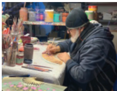
Fan being hand painted